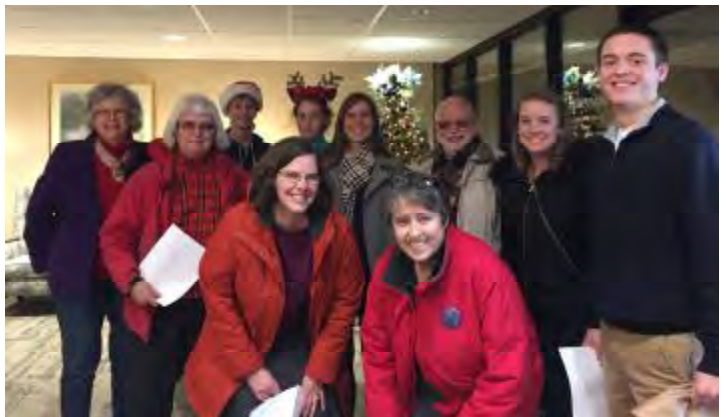
One of our caroling groups, December 10, 2017